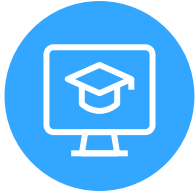
How adults learn