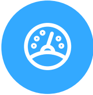
Scalability and reach